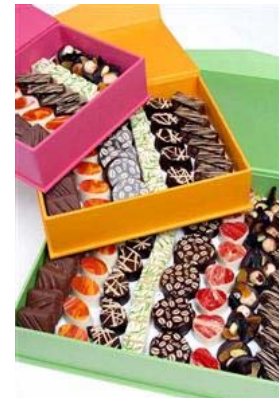
Chocolate boxes from the Four Seasons Nile Plaza are a treat.

The baskets are brilliantly personal and useful gifts, not to mention festively decorated. Perfect as a housewarming gift or to give to