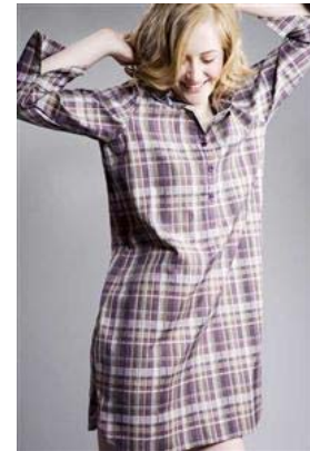
Angelly nightshirts are perfect gifts to give and receive.