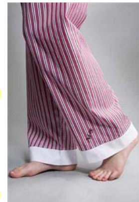
Angelly's loungewear pants.