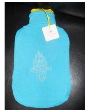
Perfect cover for your winter hot water bottle.